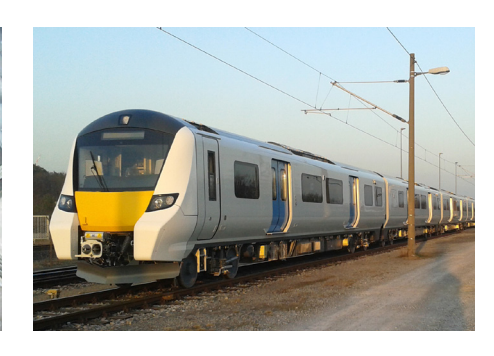
References of a similar product ESF 40

The ALPHA ESF 40S cable termination is totally maintenance free. The used silicone rubber sheds can be used in extreme climatic conditions and high polluted areas. Therefore the ESF 40S is an ideal product for rolling stock applications.