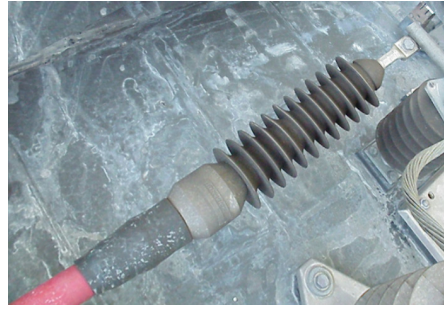
Reliable and maintenance free

To achieve the required creepage distance at a defined conductor diameter, the cable termination is designed with six, ten, fourteen or eighteen sheds. This ensures that the selected cable termination has the required dielectrically properties at minimum space requirements, weight and costs.